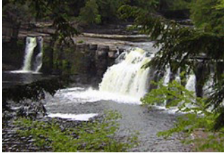
Manabezho Falls on the Presque Isle River